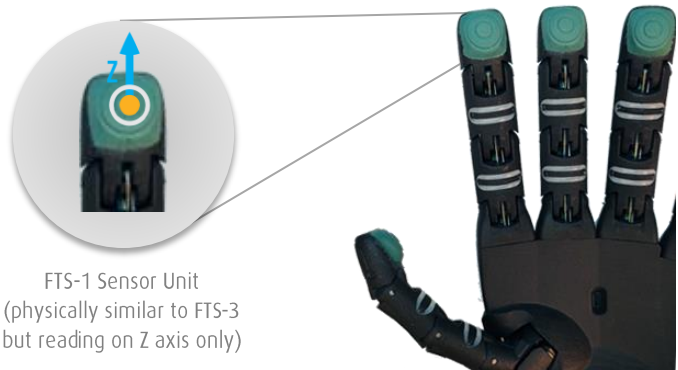
FTS-1 Sensor Unit (physically similar to FTS-3 but reading on Z axis only)